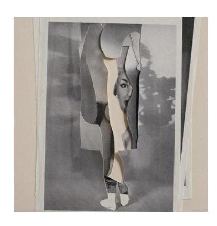
Goshka Macuga Searching for Hannah, 2014 Photograph 15.75 in x 11.81 in / 40.0 cm x 30.0 cm Edition of 40 This work is signed and numbered by the artist. $747.00