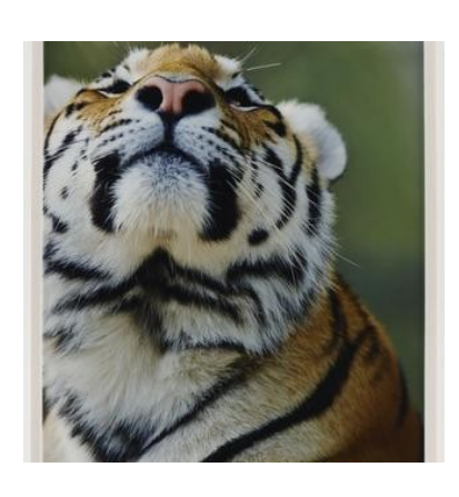
Diana Thater Zo\ddot{c} , 2005 Photograph 29.83 in x 19.83 in / 75.8 cm x 50.4 cm Edition of 7 Signed, dated, and numbered by the artist on verso. Unframed: $15,000.00