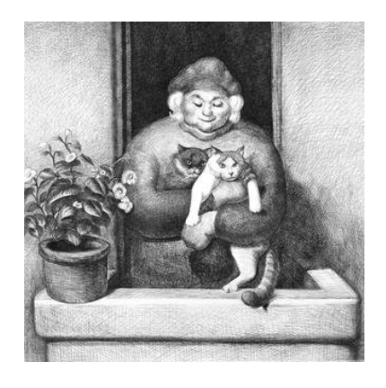
Wang Xingwei Old Lady with Cats, 2013 Print 26.18 in x 27.36 in / 66.5 cm x 69.5 cm Edition of 15 Signed by the artist and includes a certificate of authenticity. $20,900.00