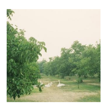
Youngsuk Suh Swans, 2008 Photograph 36.00 in x 46.00 in / 91.4 cm x 116.8 cm Edition of 8 Signed by the artist on verso. $4,000.00