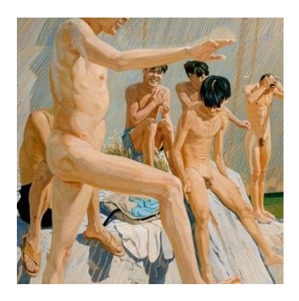
Liu Xiaodong Bathed in Sunlight, 2008 Print 47.24 in x 51.18 in / 120.0 cm x 130.0 cm Edition of 30 Signed by the artist and includes a Certificate of Authenticity. $12,200.00