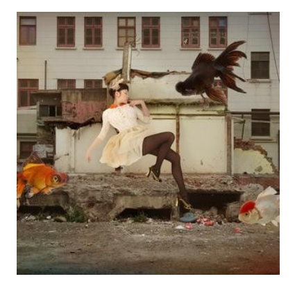
\label{eq:main_model} \begin{tabular}{ll} \textbf{Maleonn} \\ \textit{Dream within a Dream, 2011} \\ \begin{tabular}{ll} \textbf{Photograph} \\ 40.94 \ \mbox{in x 26.38 in / 104.0 cm x 67.0 cm} \\ \begin{tabular}{ll} \textbf{Edition of 30} \\ \begin{tabular}{ll} \textbf{Signed by the artist and includes a Certificate of Authenticity.} \\ \textbf{\$1,300.00} \\ \end{tabular}