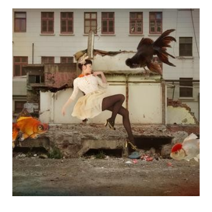
\label{eq:main_model} \begin{tabular}{ll} \textbf{Maleonn} \\ \textit{Dream within a Dream, 2011} \\ \begin{tabular}{ll} \textbf{Photograph} \\ 40.94 \ \mbox{in x 26.38 in / 104.0 cm x 67.0 cm} \\ \begin{tabular}{ll} \textbf{Edition of 30} \\ \begin{tabular}{ll} \textbf{Signed by the artist and includes a Certificate of Authenticity.} \\ \begin{tabular}{ll} \textbf{$1,300.00} \\ \end{tabular}