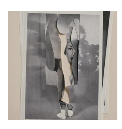
Goshka Macuga Searching for Hannah, 2014 Photograph 15.75 in x 11.81 in / 40.0 cm x 30.0 cm Edition of 40 This work is signed and numbered by the artist. $756.00