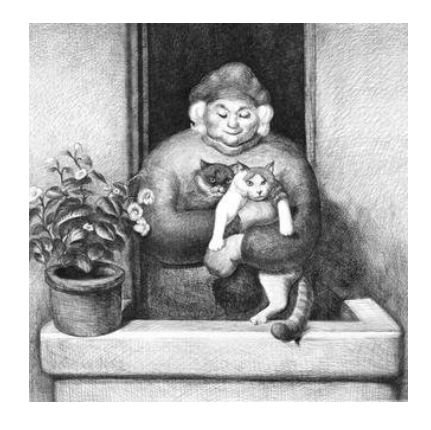
Wang Xingwei Old Lady with Cats, 2013 Print 26.18 in x 27.36 in / 66.5 cm x 69.5 cm Edition of 15 Signed by the artist and includes a certificate of authenticity. $20,900.00